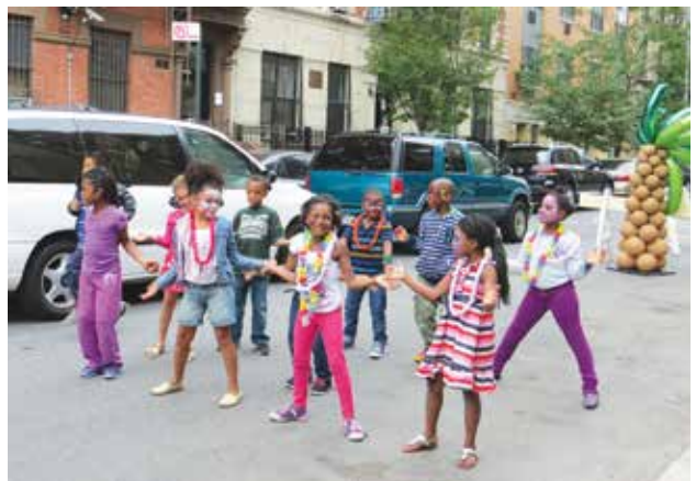
Summer Street Fair sponsored by Orrick, Herrington & Sutcliffe LLP

Twice this year, former NBA player Jerome Williams visited with Storefront Academy students. In January, he spoke to our Cluster 3 students, telling them about his life and career and the importance and power of a good education, and inspired our students to make good choices in life. In May, he spoke to 8th graders about how “A Winner Never Gets There Without A Coach,” focusing on people in the students’ lives who influence and/or inspire them.