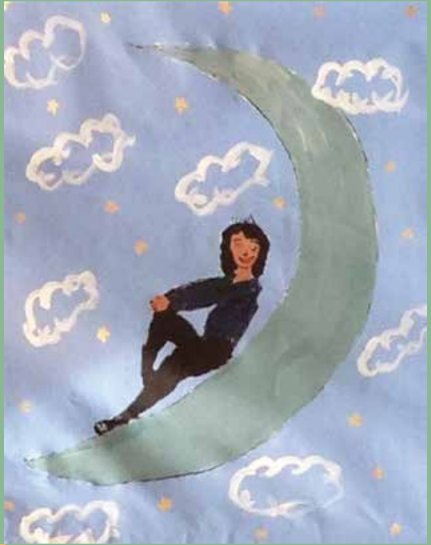
Paintings by Storefront Academy Student Artists.