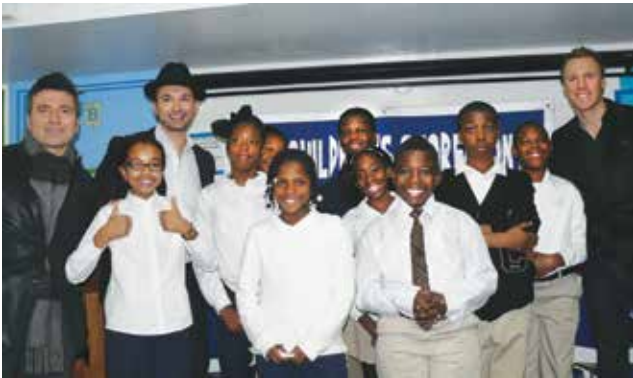
The Tenors and the Storefront Choir

Celebrity Chef Marcus Samuelsson continues to show his dedication to Storefront Academy. He was a co-chair of our Spring Gala, and also regularly engages our children in educational activities. In the fall, he hosted 8th graders at his signature Harlem restaurant, Red Rooster, for a lesson in molecular gastronomy. One student was given the opportunity to work in the kitchen as guest chef, with his family as dinner guests for the evening. In May, Storefront Academy students from Cluster 3 (grades 5, 6, 7, and 8) were guests of Red Rooster as part of a public television taping by WGBH-Boston.